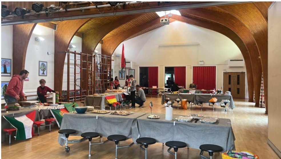
Final preparations for the fair!