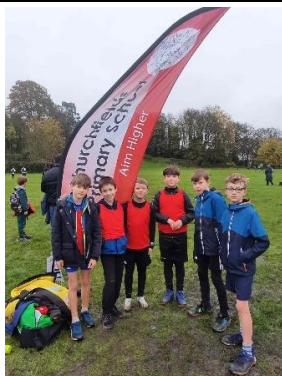
Some of the cross-country competitors