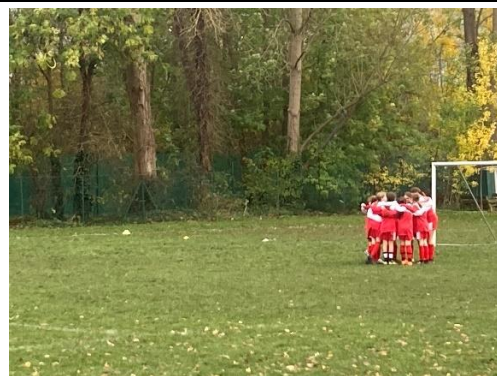
A pre-match tactical huddle for the girls' football team

We have enjoyed competing against other schools in the Year 4 – 6 swimming gala for boys and girls; the boys' football team won a friendly against Balgowan 7 – 2; an amazing running team battled the weather at the Bromley Year 5 and 6 cross country with some huge improvements in placings and three children placing 23 rd , 26 th and 3 rd ; the girls' football team played a tense 0-0 draw against Clare House at home and finally, both football teams are out this afternoon playing away at Alexandra Juniors!